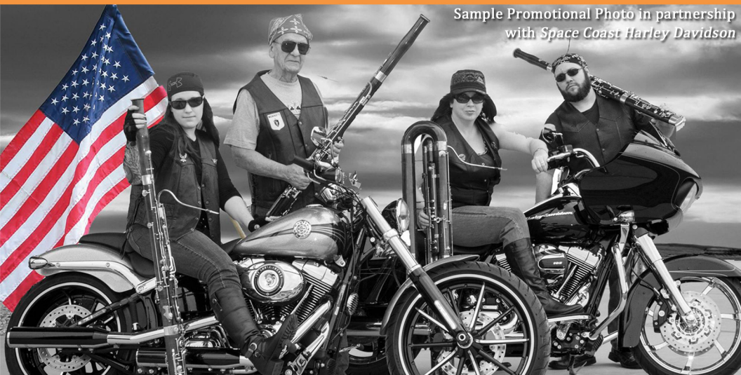
Sample Promotional Photo in partnership with Space Coast Harley Davidson

The SCSO will tailor a personalized sponsorship package that meets your unique needs and budget.